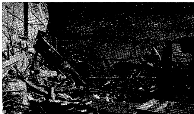
Only twisted rubble remains where the American Hospital Supply Corporation warehouse stood not 24 hours before this picture was taken. AOCS Official Supplies, stored in the adjoining building, miraculously survived the fire.